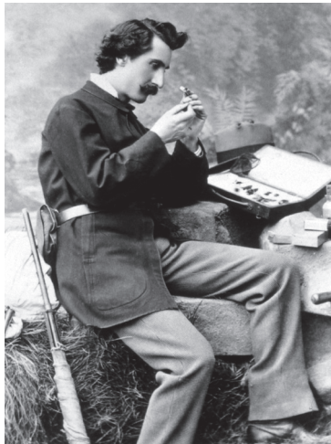
Charles Valentine Riley Examining an Insect.